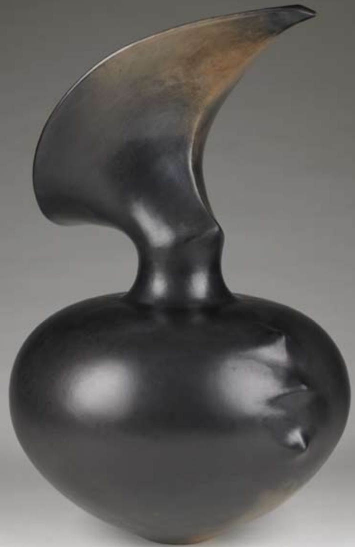
Magdalene Odundo, Mangbetu , 1993, reduced red clay, 15¼ x 12 x 15 inches. Courtesy the Birmingham Museum of Art; Museum purchase.

Kalup Linzy , American (b. 1977) Chewing Gum and Dirty Trade from SweetBerry Sonnet , 2008 video 9:52 minutes Courtesy the artist and Taxter & Spengemann, New York