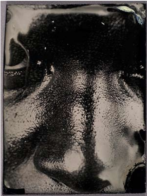
Myra Greene, American, Untitled from the series Character Recognition , 2004–2007, ambrotype on black glass, 3 x 4 inches each.

Beverly McIver , American (b. 1962) Dear God, I, II, III, and IX , 2003 oil on canvas 30 x 30 inches each